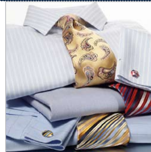
Men's Shirts Classic & Slim fit were £69 & £79 now £25