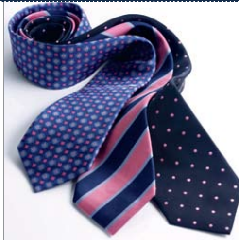
Men's Ties were £65 now £25