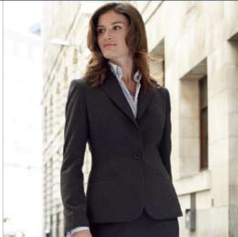
Ladies Suits were £285 now £180