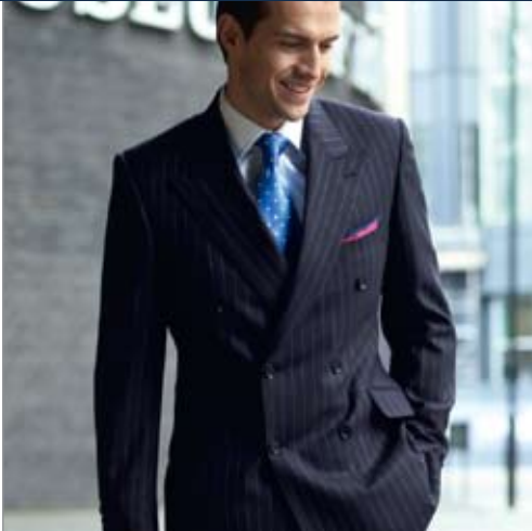
English Suits were £400 now £200