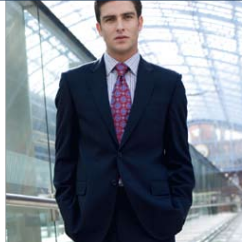
Italian Travel Suits were £500 now £250