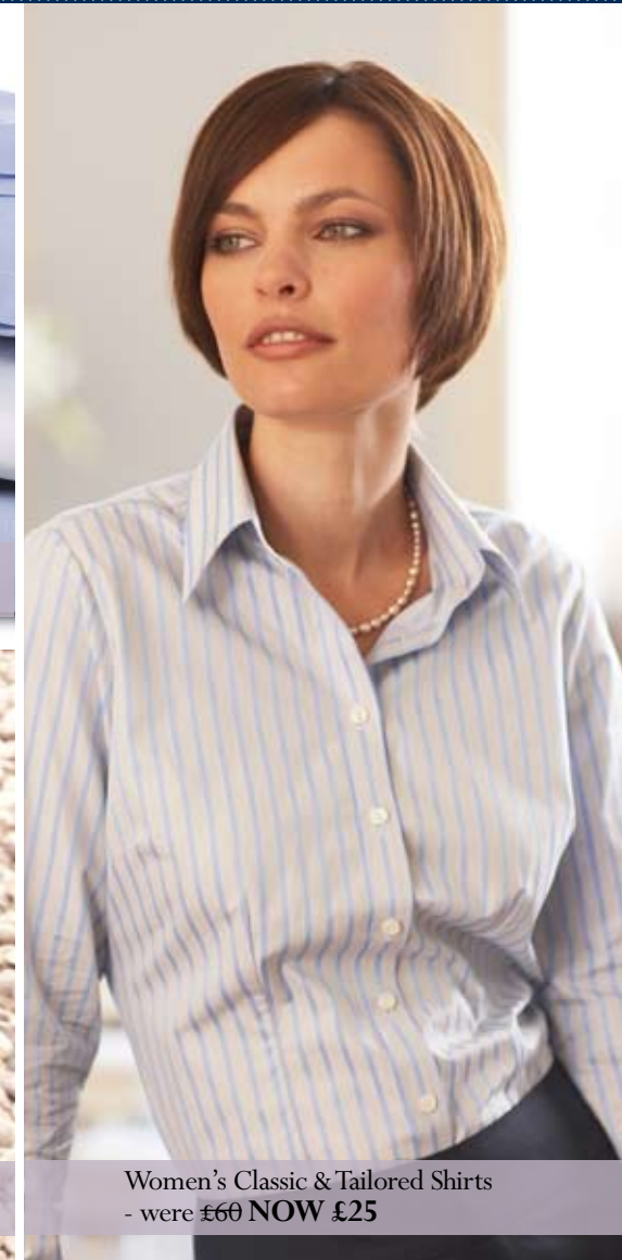
Women's Classic & Tailored Shirts - were £60 NOW £25

To take advantage of this offer simply print this voucher and bring it to our stores or visit our website. www.ctshirts.co.uk/corp1009