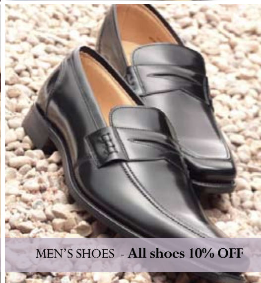
MEN'S SHOES - All shoes 10% OFF