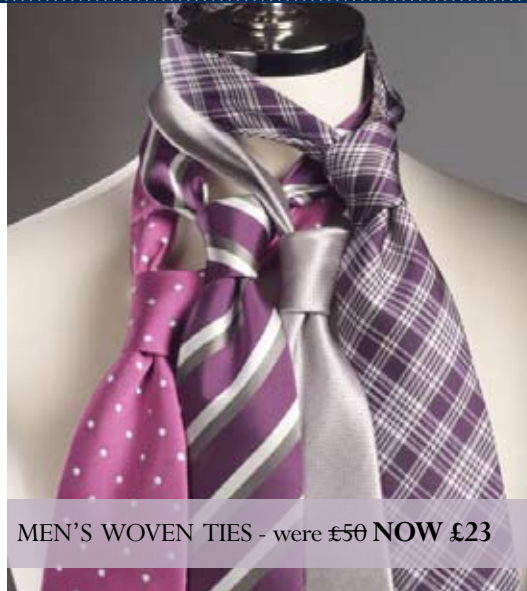
MEN'S WOVEN TIES - were £50 NOW £23