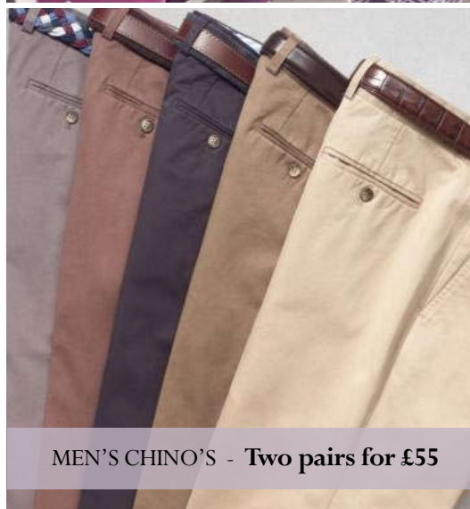
MEN'S CHINO'S - Two pairs for £55