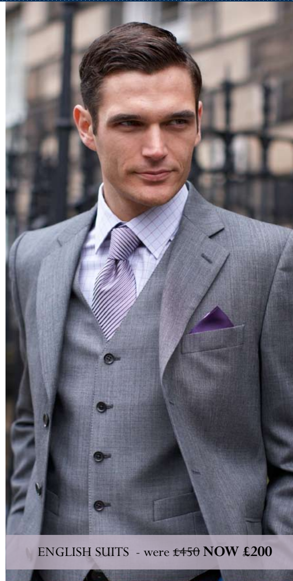
ENGLISH SUITS - were £450 NOW £200